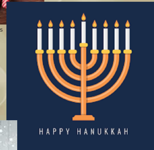
Hanukkah is a holiday that takes place for 8 nights with 8 presents!