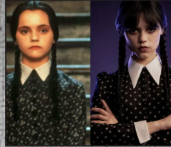
A side-by-side comparison between the Wednesdays played by Christina Ricci from The Addams Family on the left and Jenna Ortega from Wednesday on the right.