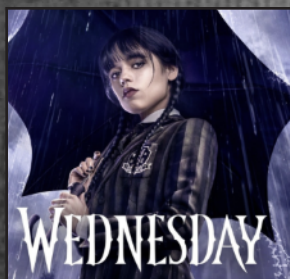
Wednesday Addams using an umbrella to shield herself from the rain.