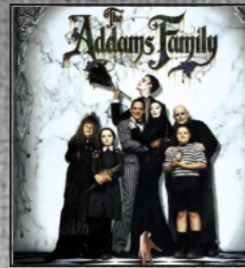
The movie cover of The Addams Family featuring all the main characters in the film.