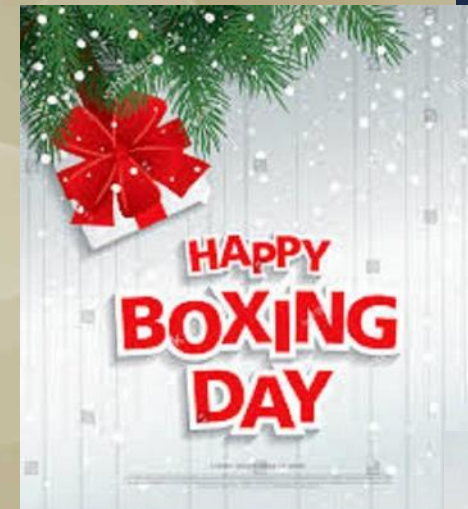
Boxing day is a popular holiday in Australia!