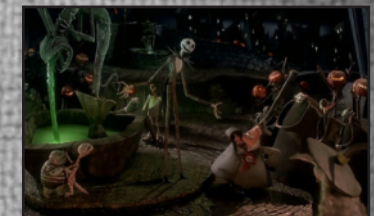
Jack Skellington in Halloweentown giving a speech to the monsters as Pumpkin King.

Even though The Nightmare Before Christmas is a Halloween movie, it's no doubt that this is a versatile movie that is well-loved by many and comes with different views and perspectives.