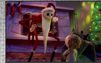
Jack Skellington in Christmastown dressed as Santa Claus to spread Christmas joy to the children.