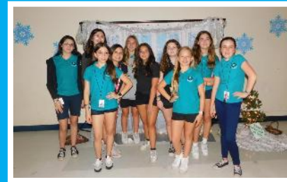
This group of friends had a blast at the photo op while partying the night away!