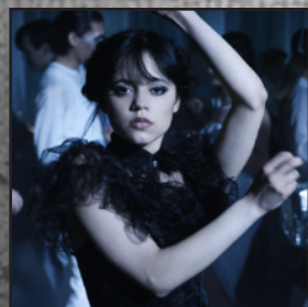
Wednesday at the Rave'N ball dancing while the music played in episode four.