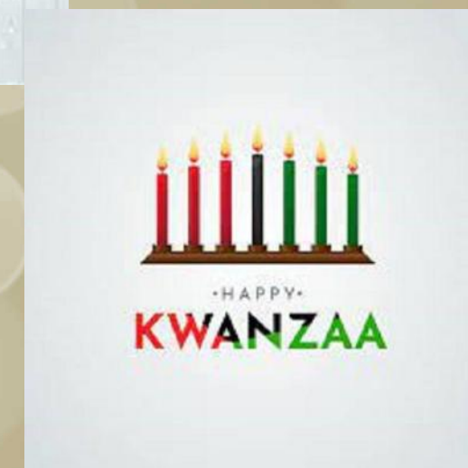
Kwanzaa is a popular holiday in Africa from December 26th to January 1st.