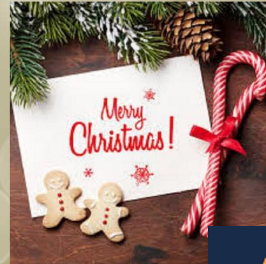
Christmas is celebrated by the Christians to hail the birth of Jesus.

Kwanzaa is one of the most popular holidays in December but is honored mostly in Africa. This holiday is celebrated from December 26th to January 1st. Kwanzaa was created in the 1960's and by a person named Maulana Karenga, who is an activist, author, and professor of Africana studies. To celebrate this holiday families, gather to give gifts, share feasts, and light candles in honor of their passed loved ones.