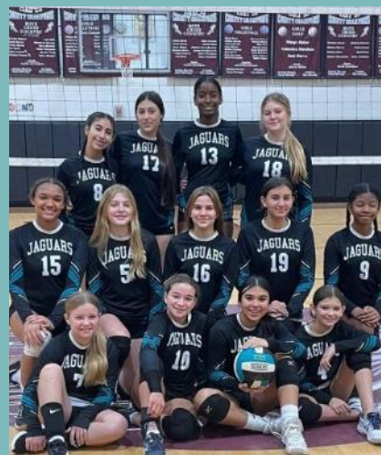
The girls team has worked very hard and loves playing together.